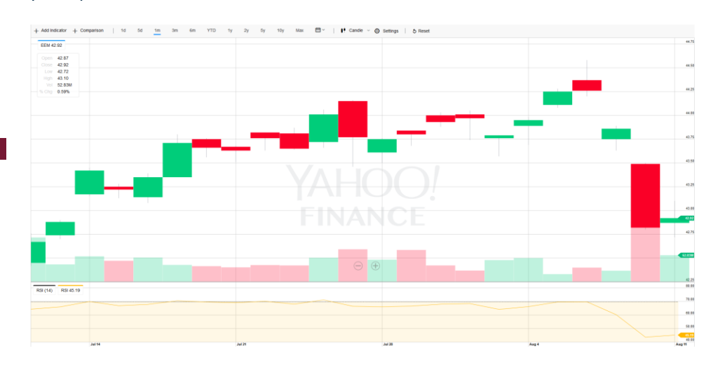
iShares MSCI Emerging Markets ETF

Further tensions between the US and North Korea were also a welcomed excuse for some investors to sell after the past two months of strong performance. Most markets worldwide lost some ground which is not unreasonable looking into this year's performance so far.